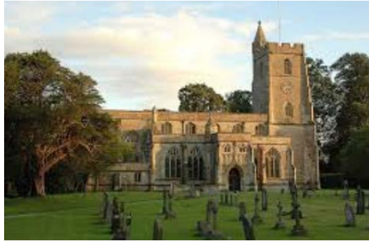
Fig. 1 Naum Cogy Manor design

For a long time, modern landscape design has developed to a large extent in some countries in the United States and Europe. During this period, the situation in the UK has been different. It can be said that the impact of modern landscape design on the UK is extremely weak. The Spanish ghost architect Antonio Gaudí advocates the revival of the Gothic style, emphasizing the architectural and landscape-like design of nature. Guell Park (Fig. 2), one of Gaudi's most representative works, is considered to be a magnificent flower in the history of design. In Guer Park, the central axis of the classic style is used in the layout of the track. In the architecture and landscape, the elements of space, color and sculpture are coordinated and unified, and the Mediterranean environment is combined with the natural environment of the site. Perfectly integrated, it creates a gorgeous world like a fairy tale world.