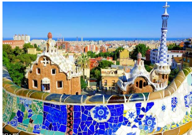
Fig. 2 Guell Park Design Study

For a long time, modern landscape design has developed to a large extent in some countries in the United States and Europe. During this period, the situation in the UK has been different. It can be said that the impact of modern landscape design on the UK is extremely weak. The Spanish ghost architect Antonio Gaudí advocates the revival of the Gothic style, emphasizing the architectural and landscape-like design of nature. Guell Park (Fig. 2), one of Gaudi's most representative works, is considered to be a magnificent flower in the history of design. In Guer Park, the central axis of the classic style is used in the layout of the track. In the architecture and landscape, the elements of space, color and sculpture are coordinated and unified, and the Mediterranean environment is combined with the natural environment of the site. Perfectly integrated, it creates a gorgeous world like a fairy tale world.